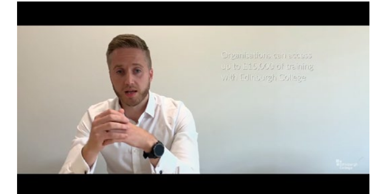
Press on this image to watch our video explaining the Flexible Workforce Development Fund (YouTube)

Follow this link for more information: edinburghcollege.ac.uk/fwdf